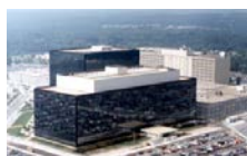
Intel, Cyber & Security